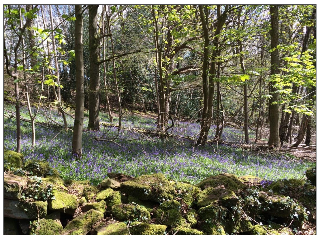
Figure 4 Wye Valley Woodland

On a Monmouthshire scale the following biodiversity and ecosystem resilience issues, raised in the SoNaRR report, are of relevance: