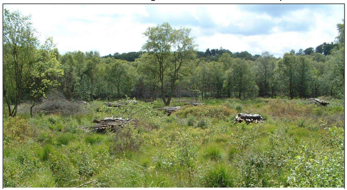
Figure 2 A Local Wildlife Site in the Wye Valley

In areas where agricultural intensification has not depleted quality there are networks of unimproved