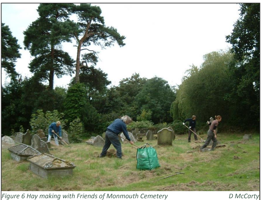
Figure 6 Hay making with Friends of Monmouth Cemetery

It was also considered important to review what other organisations are currently doing to deliver for Biodiversity and Ecosystem Resilience to allow future collaborative work to take place to maximise the benefits for Biodiversity. Organisations considered include Natural Resources Wales, Brecon Beacons National Park Authority, Gwent Wildlife Trust, Bee Friendly Monmouthshire, Monmouthshire Meadows Group, Botanical Society for the British Isles, Gwent Ornithological Society, Wye Valley Area of Outstanding Natural Beauty Unit, Canal and Rivers Trust, RSPB (Living Levels Project), Farming Connect (Glastir), Wye and Usk Foundation and Monnow Rivers Association. These organisations have highlighted areas of concern in relation to biodiversity and ecosystem resilience relevant to Monmouthshire and identified projects and programmes with which they are currently engaged. The organisations have also made suggestions of areas where Monmouthshire County Council could have the biggest positive impact on Biodiversity and Ecosystem Resilience and the most popular of these are listed in Figure 7 (below).