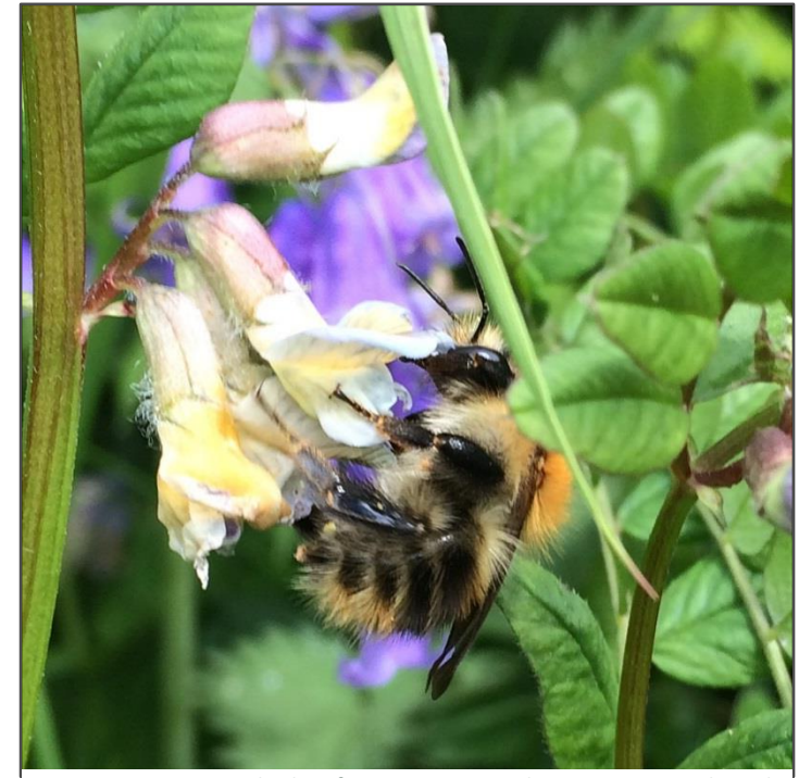
Figure 3 Common carder bee foraging on a road verge K Stinchcombe

Further information can be used to increase our understanding of biodiversity and ecosystem resilience as it becomes available e.g. the Monmouthshire Rare Plant Register<sup>5</sup> and other studies such as those relating to tranquillity and dark skies.